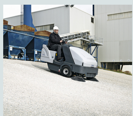
Ramp climbing ability - up to 25%