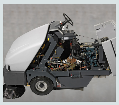
All major components are accessible quickly without the need for tools. Maintenance is fast and simple