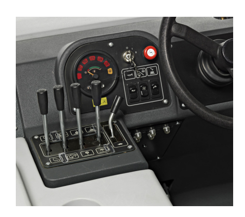
Easy to use operating controls mean more efficient cleaning