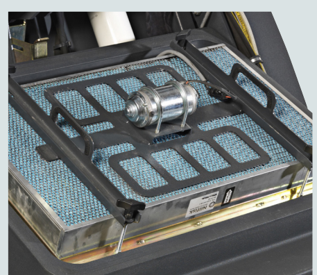
The patent pending Multispectrum™ filter shaker prevents build-up of dust and clogging for better performance